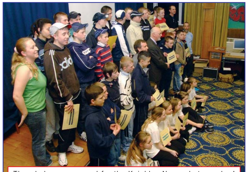
The whole group posed for the Keighley News photographer!

“The young people who participate in the excellent Positive Futures programmes have benefited greatly from the opportunities presented to them. It helps to develop their attitudes and behaviours, and encourages them to expand their own horizons and increases their self-esteem. The education elements of the programme enables them to learn through experience and develop a new range of skills. The YOT fully supports Positive Futures as we believe it offers opportunities for personal achievement and participation in activities that may not otherwise be available to them.”