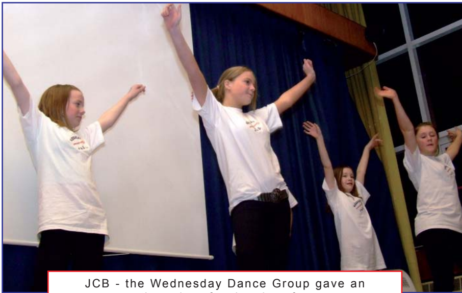
JCB - the Wednesday Dance Group gave an energetic and professional performance.